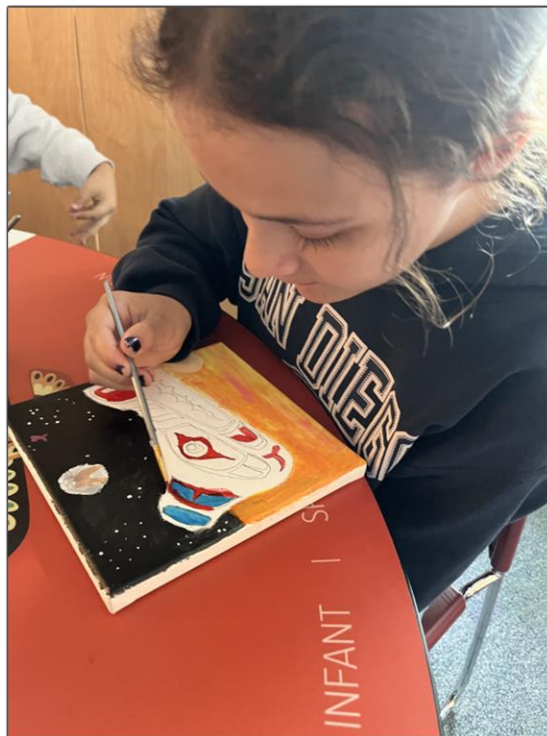
Indigenous students painting Coast Salish inspired art.